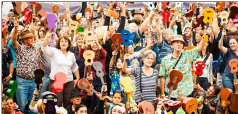
A section of the crowd from last year's WRA

Bring a blanket and have a picnic with the family.