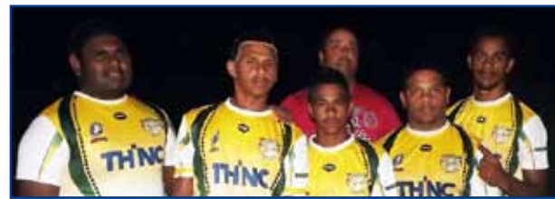
Left: Palm Island's Barracudas u-18 side and Above: the Prior boys Below: Barracudas teams & supporters