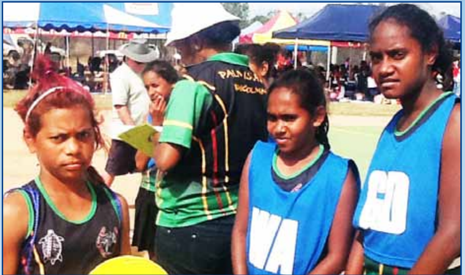
Above: Palm Island netballers at recent games in Charters Towers

Jets 21 Butler Bay Bulls 18 Skipjacks 16 Brothers 16 Mundy Bay Warriors 11 Hornets 10