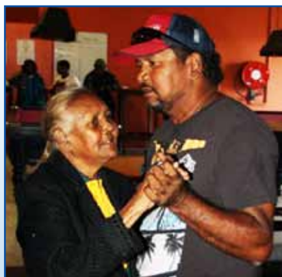
57 Strike Day pics