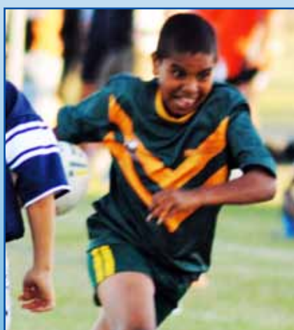
Laurie Spina Shield