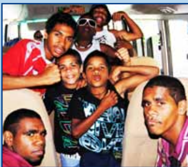
Our 'larrikin' boxers!