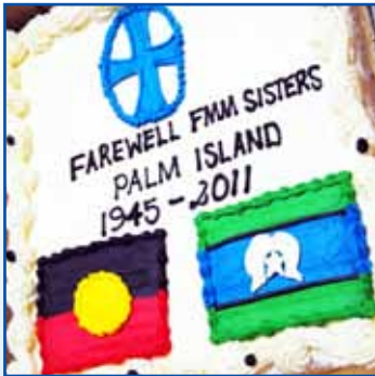
Sisters' farewell in Townsville