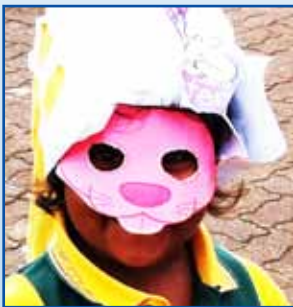
Preppies' Easter Parade pics