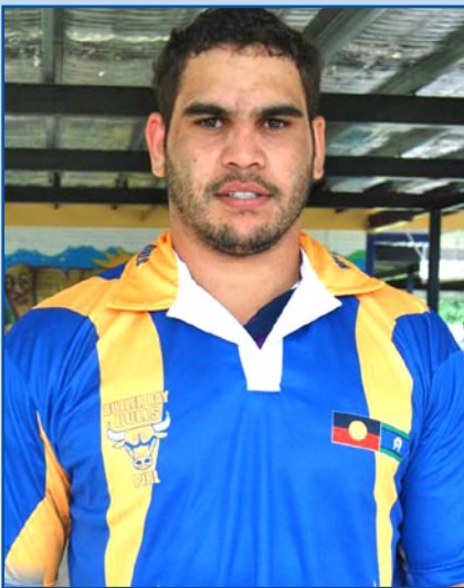
Above: Greg Inglis sporting a Butler Bay Bulls jersey & Left: at St Michael's School

The competition is named after former Brisbane Broncos, St George, Queensland State of Origin and Test forward turned commentator, Gorden Tallis, who played with Centrals club in Townsville.