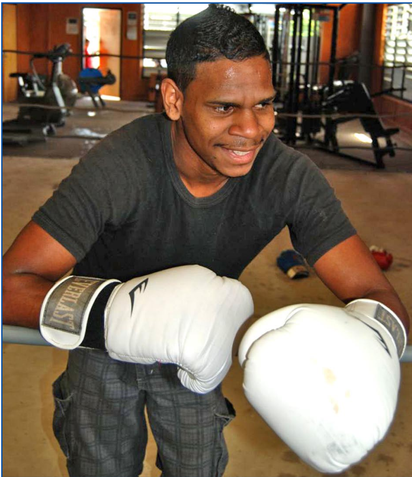
Palm Island boxing champion Reggie Palm Island resting on the ropes at training

The next Palm Island Voice will have a BIG story on the boxers who will be travelling to SYDNEY where they will give their beloved Palm island positive national publicity - don't miss it!!