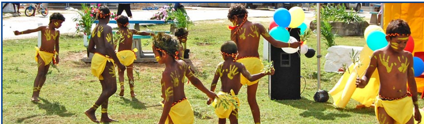
Above left: Main St parade. Above Right: Wheelbarrow Races. Above: dancing in the mall and Left, in the park. Below: 'Adults' revenge' - banana throwing in the park. Bottom: the Friday night concert