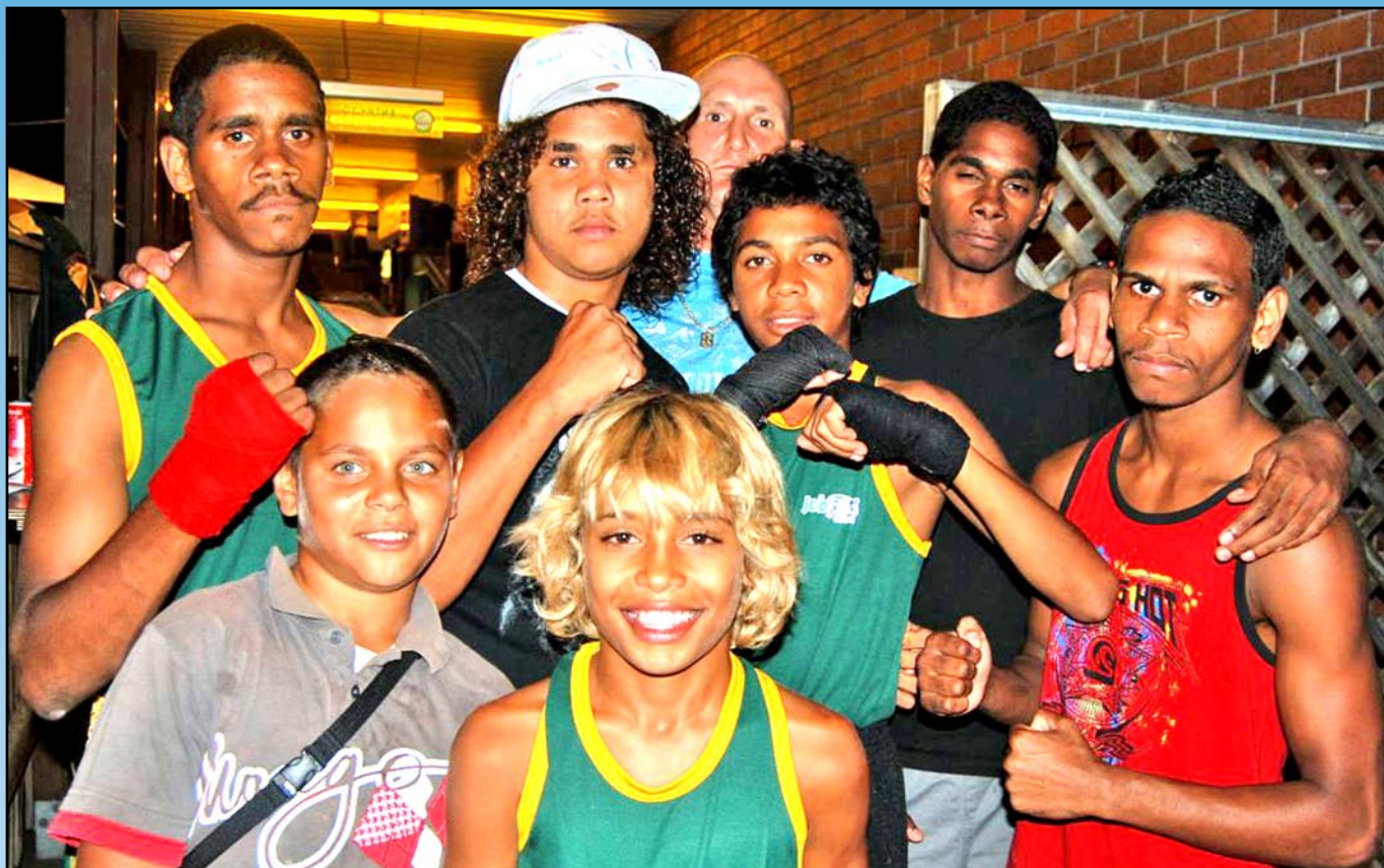
PALM ISLAND BOXERS at the Sunstate Amateur Boxing Tournament in Townsville last Friday night.