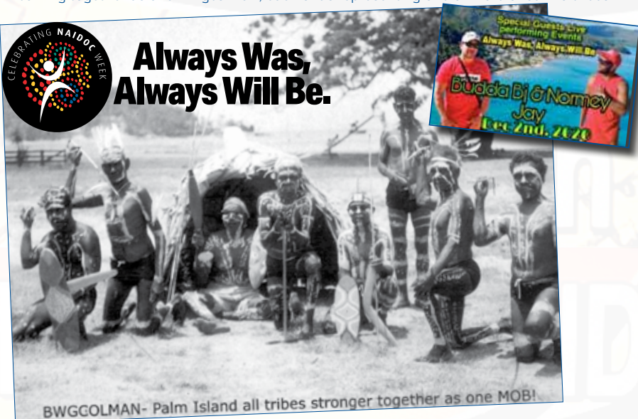
BWGCOLMAN - Palm Island all tribes stronger together as one MOBI