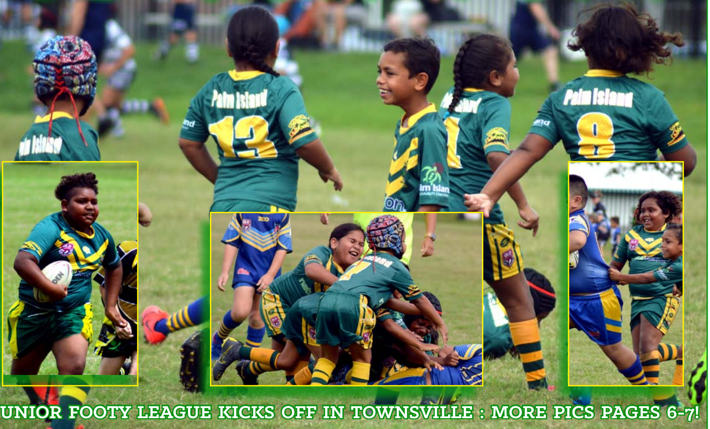
JUNIOR FOOTY LEAGUE KICKS OFF IN TOWNSVILLE : MORE PICS PAGES 6-7!