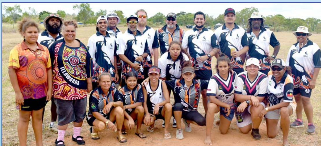
PICTURED LEFT: The Garbutt Magpies ready to take on the Goldfield Ashes last weekend in Charters Towers.

This year's AGM for the Palm Island Rugby League will be held in February.