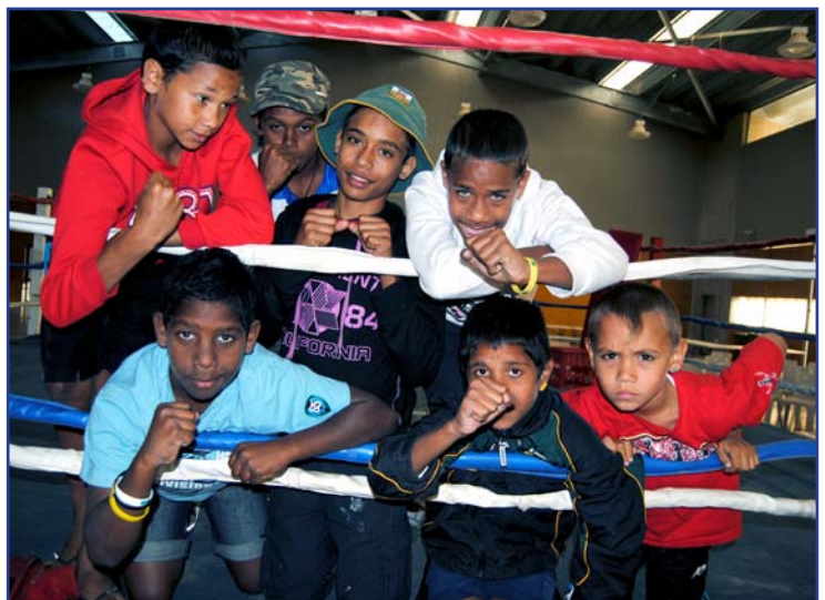
FLASHBACK! This team of boxers travelled to Richmond, western Queensland, together in 2011 - recognise any of them?!

Tournaments on Palm in 2015 and 2012 attracted huge crowds.