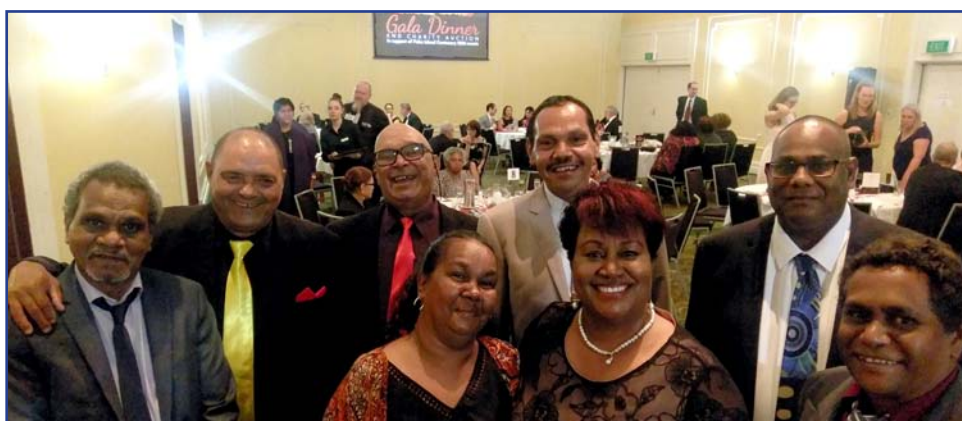
Top: Descendance performance; Above Yarrabah and Palm Island Councillors at the Gala Dinner