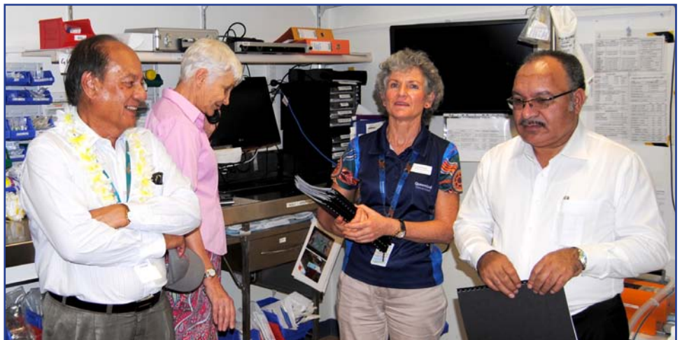
Many thanks to The National at http://www.thenational.com.pg/islanders-welcome-pm

"Many of the people who are living on Palm Island came from Torres Strait Island and many of them originated from Daru," O'Neill said. "I am hoping to expand some of the things we