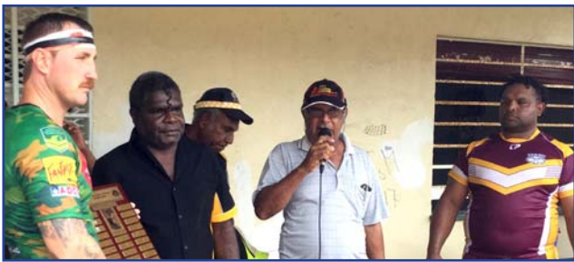
BILL COOLBURRA MEMORIAL SHIELD