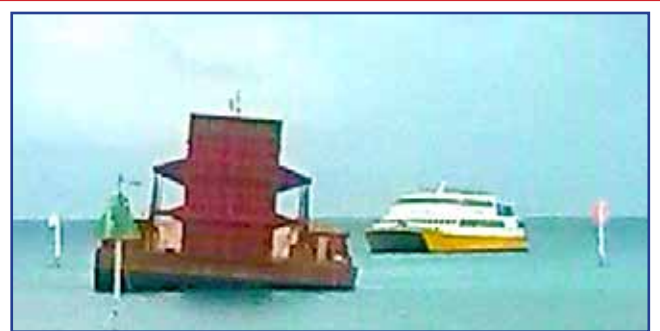
THE DAY THE SEASWIFT BARGE GOT STUCK on a reef several loads of passengers had to be taken to and from the ferry one boat at a time.

It was his wish that the Army and Palm Island play an annual game.