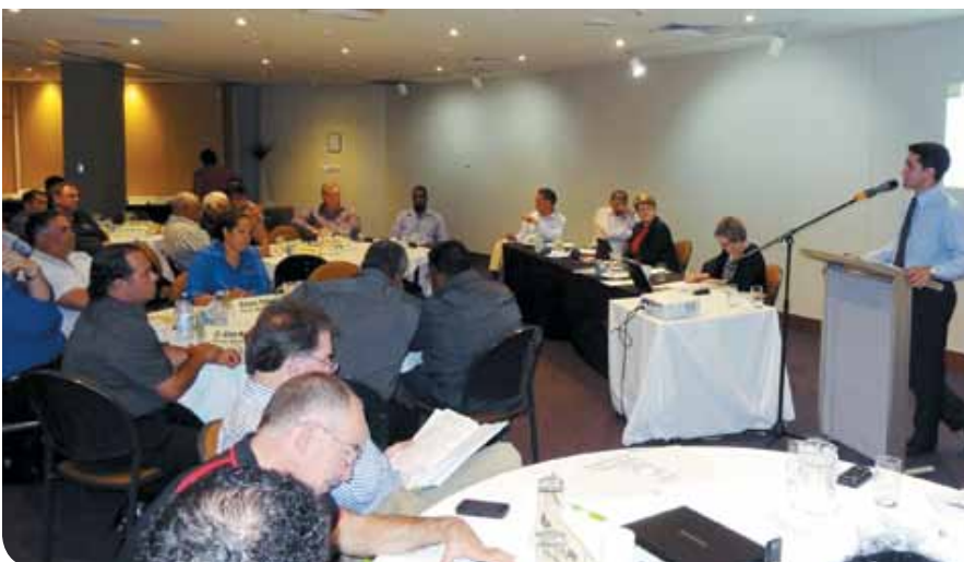
Local Government Minister David Crisafulli addressing the forum