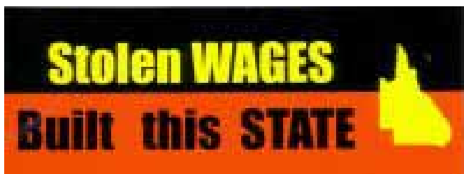
Above: The Stolen Wages sticker campaign, launched in 2005.