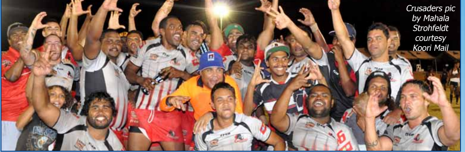
Crusaders