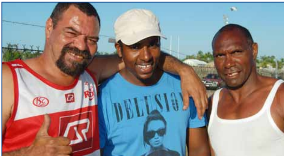
Above: Crusher, Africa & Lex

Snr Cons McDonald is currently posted in south east Queensland.