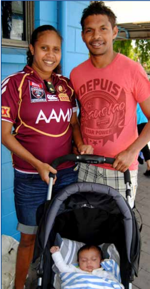
Below: Other ferry travellers arriving in Townsville at the end of August