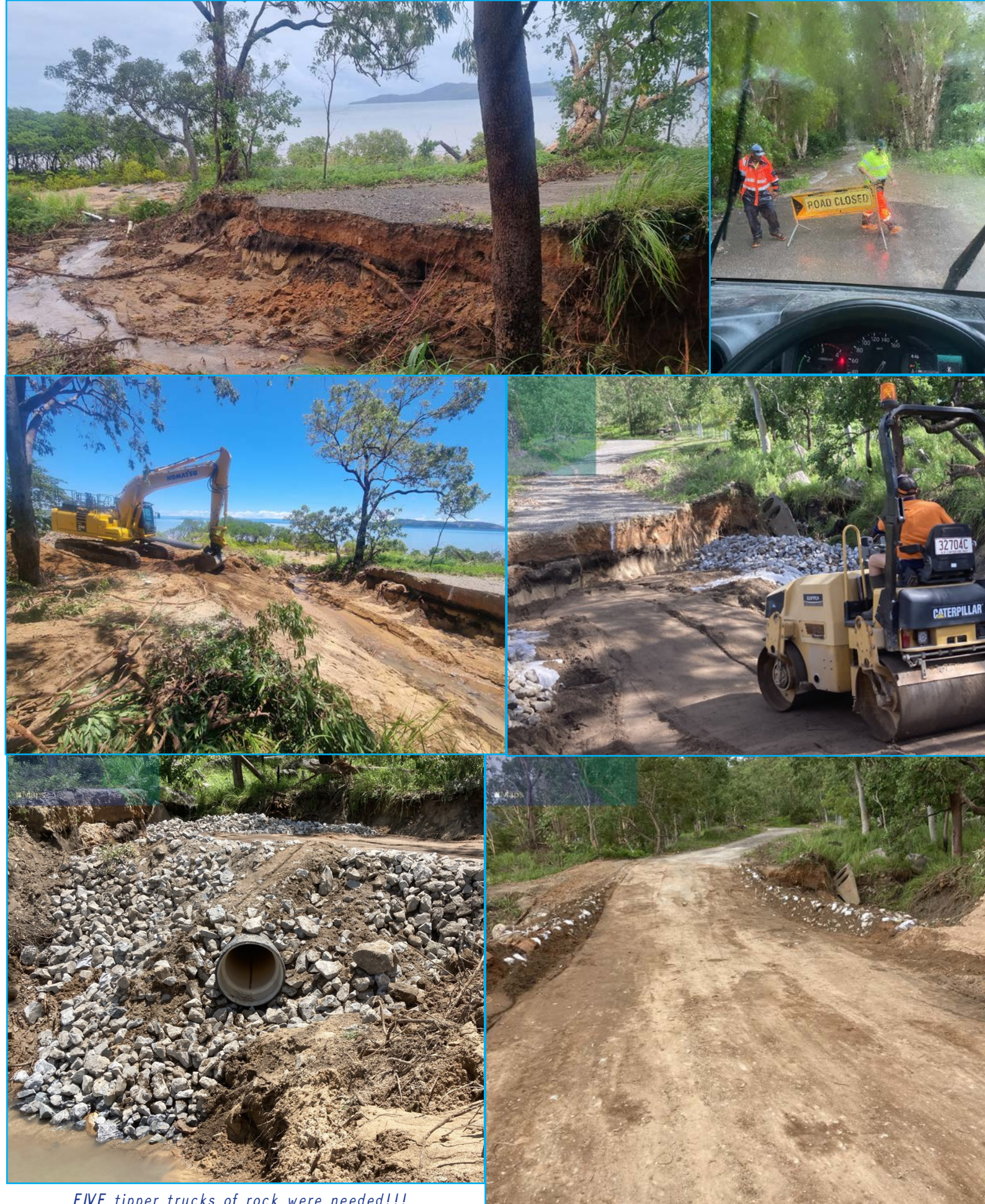
FIVE tipper trucks of rock were needed!!!