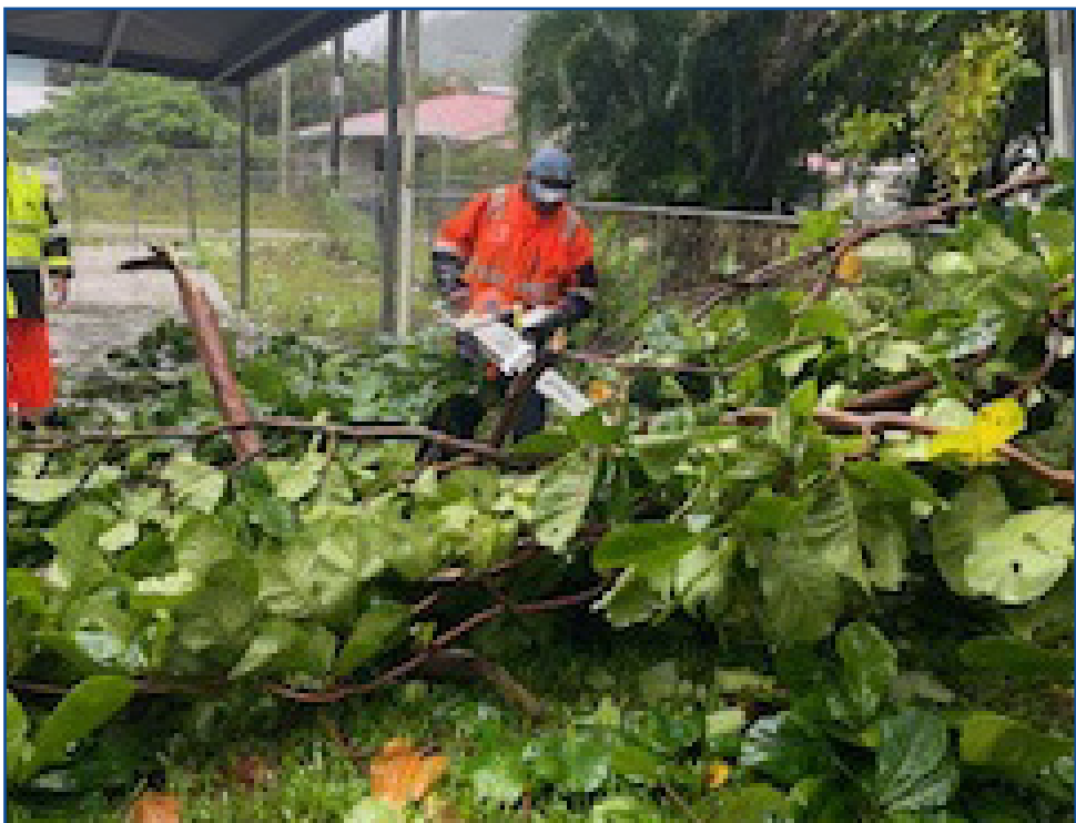
BELOW: Council crews also jumped in to help Tane and Alison from Cairns Rope Access (CRA) contractors, facilitated by Transport & Main Roads, to secure the Doctor Point land slip on Farm Road.