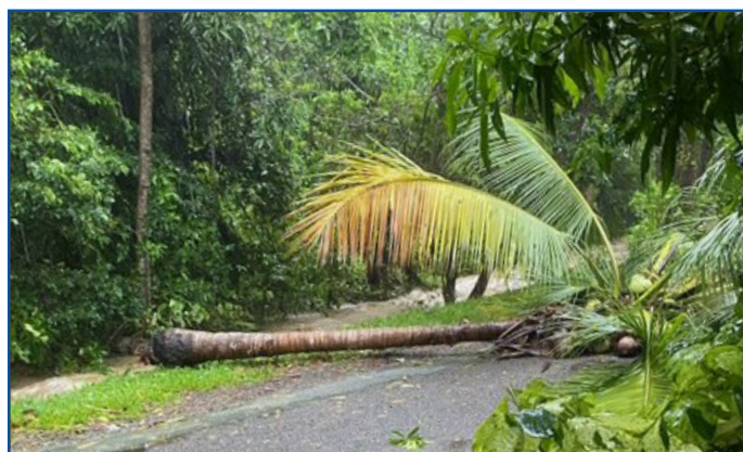
LEFT: a coconut tree down on Halifax St caused issues for residents and hit powerlines. Our Council crews have since fixed the problem.