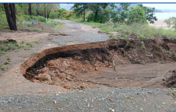
Wallaby Point Rd washout on Sunday.