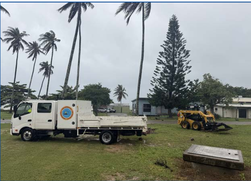
BELOW: Our council crews are out at every opportunity to keep our community safe!