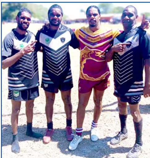
LAST MONTH'S FOOTY SUPPORTERS: LEFT: Skipjack Supporters. ABOVE: Brothers.