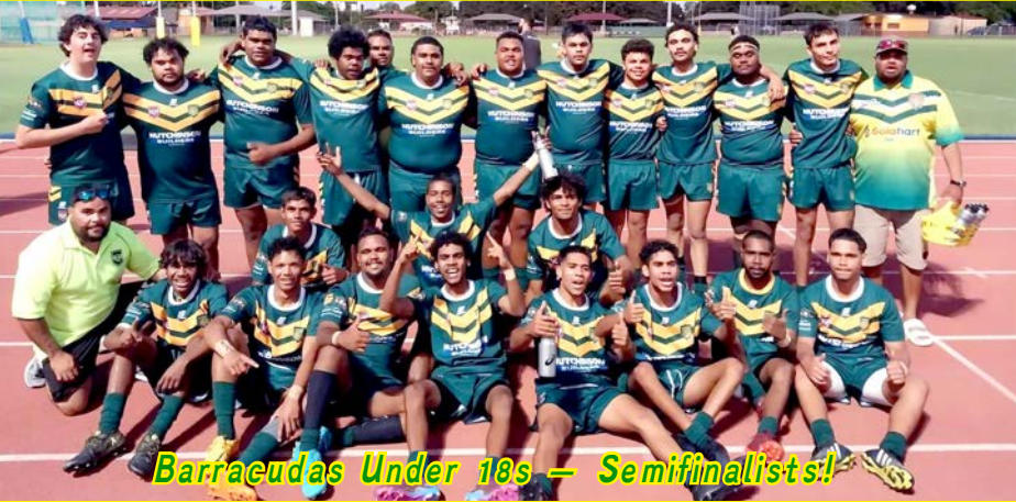
Barracudas Under 18s — Semifinalists!