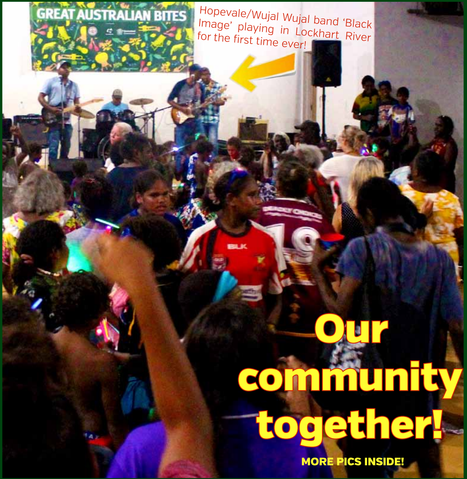
Hopevale/Wujal Wujal band 'Black Image' playing in Lockhart River for the first time ever!

Please note there may be images of deceased persons within this Newsletter.