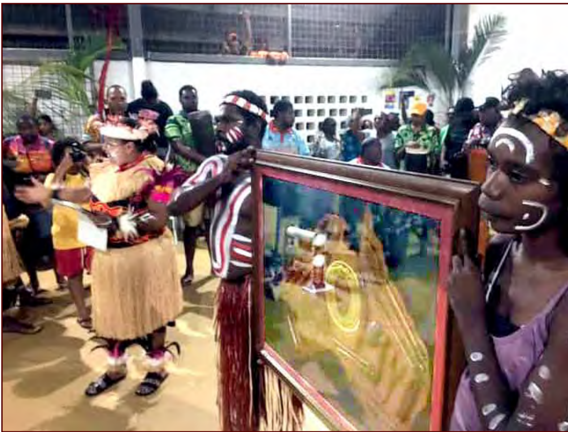
LEFT: In December last year the Laura Dance Festival Shield – in which our Kawadji Wimpa Dancers shared the win with dance groups Mayi Wunba (Kuranda) and Kayn Kowesal (Bamaga) – was passed on to Bamaga for their turn to hold the trophy.

license or run the new club so we are looking for people to put their hand up as a new Social Club committee is formed to help guide the way it is run.