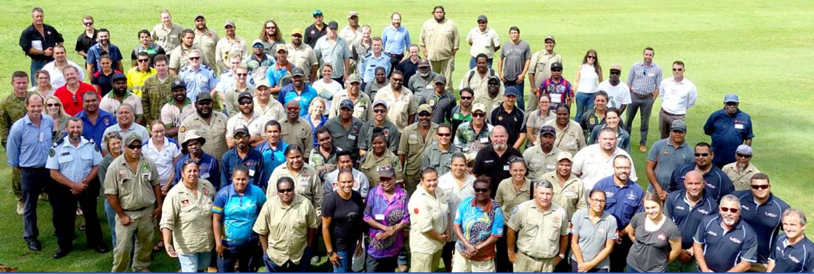
Last month more than 100 Land and Sea Rangers (State and Federally funded), including Gungandji and Mandingalbay Yidinji, attended a ranger workshop in Cairns. The annual event provides a forum for rangers to share ideas on innovation, building partnerships, conservation economy, corporate sponsorship and best practice in on-ground ranger work.