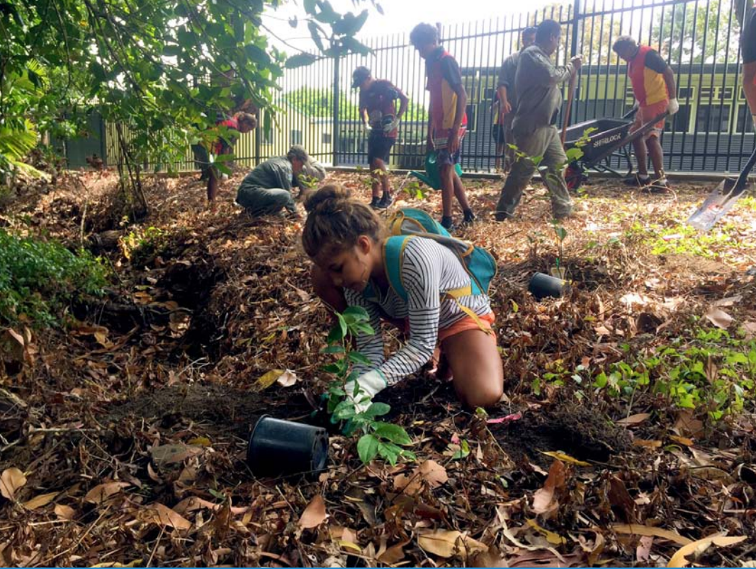
LEFT: The Yarrabah State School held a successful tree-planting event at the Junior Secondary campus last month, after working on some long term planning with the Gunggandji Land & Sea Rangers, the Yarrabah Men's Group and the community.