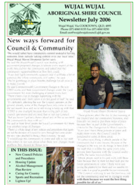
WWASC's newsletter first published in July 2006

“I think, over the years and past and present Council has laid the