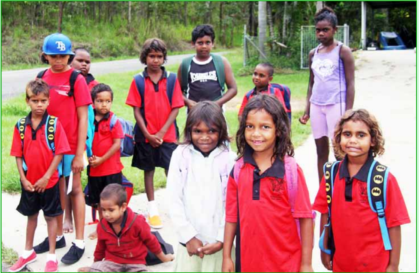
With big smiles all around these kids were waiting for their new bus to take them to school