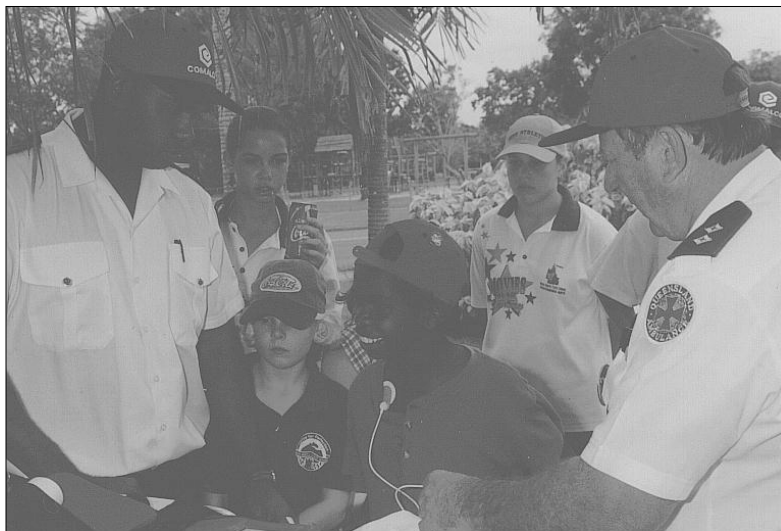
Weipa Napranum Ambulance Officers show keen youngsters what it's all about at the Croc Eisteddfod earlier this year.

He said anyone interested in the activities of the Coordination Unit or becoming an Ambulance Officer were welcome to call him on 4052 3264.