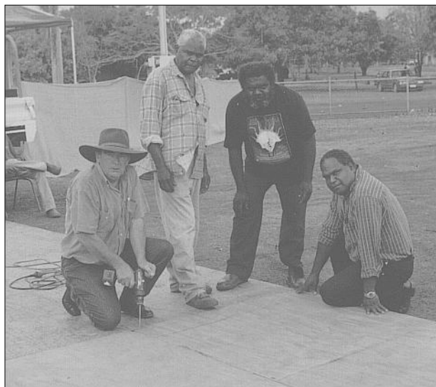
A team of Hopevale CDEP workers help prepare for the 'Golden Oldies' dance, part of the week of activities celebrating Hopevale's 50th Anniversary Celebrations

"We also have a new child care centre being built, we have nine new houses being built for the community people, and a slaughter house as well as some reservoir tanks under construction.