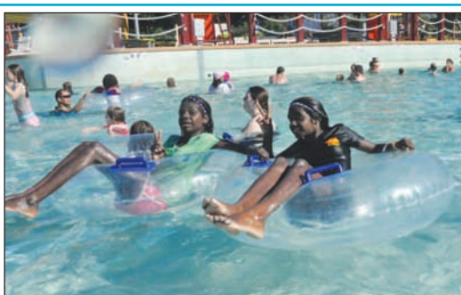
Doomadgee students in the wave pool at Dreamworld.