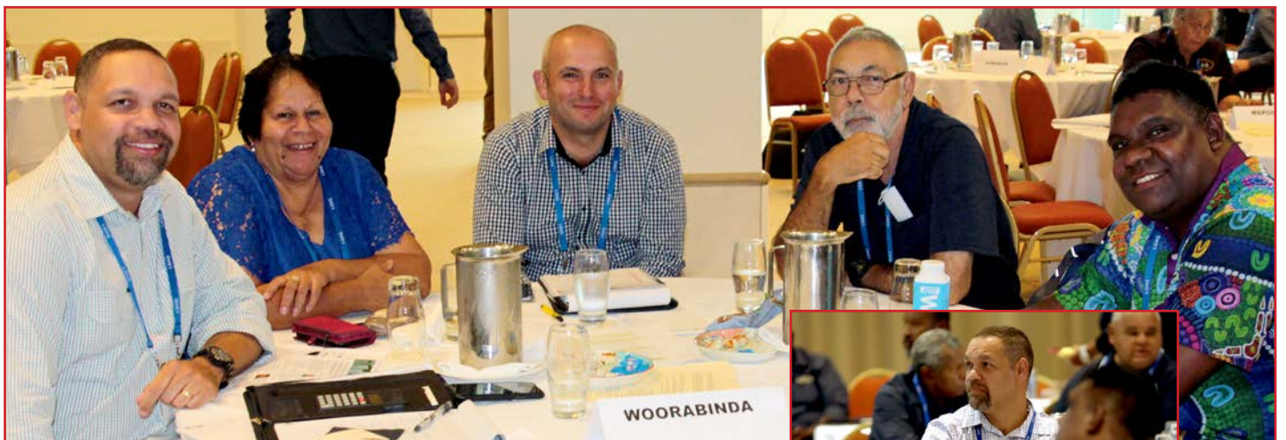
Above: Our Leadership Group and rangers at Blackboy Outstation. Below & Right: WASC at the Local Government Association of Queensland's (LGAO's) Indigenous Leaders Forum (ILF) in Cairns in April.

We hope to influence policy for change – for the better, and for all of us.