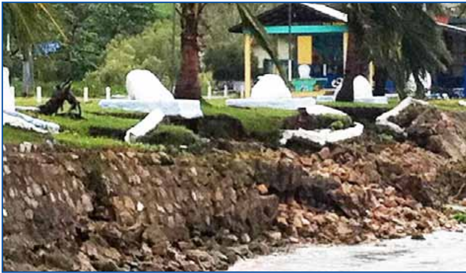
Pictured: Facing page: damage to the Council building, government buildings and the post office; This page: Above: surf was up, but no boards were around to play, Cyclone Yasi had most people safe indoors. Right: damage to the foreshore retaining wall left in the wake of Cyclone Yasi