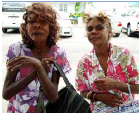
Left & Below: Palm Islanders in Townsville make their way to evacuation centres before Cyclone Yasi hits