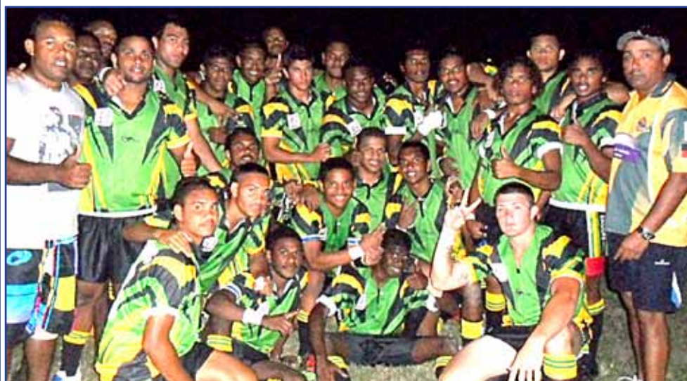
Above: the under-18 side which competed in Cairns