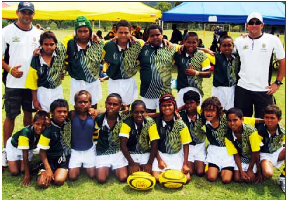
Above: Bwgcolman State School Below: St Michael's

Teams were split into two pools with St Joseph's winning the final over Heatley 4-nil.