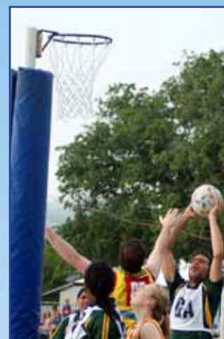
Left: Open Ladies & Below: Open Mixed teams