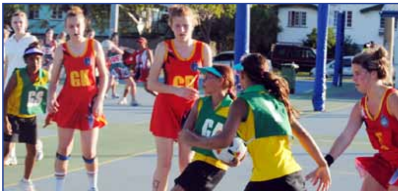
Above: U13s & Top Right: U17s + Right: U13s 'dwarfed' by taller opponents