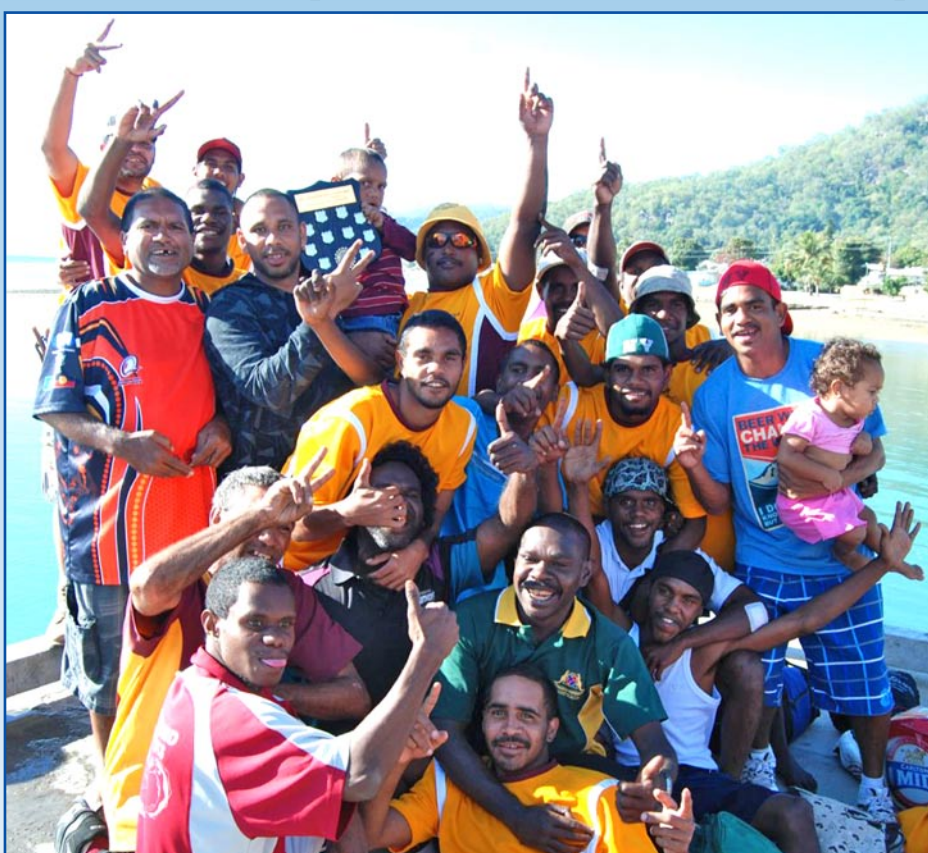
Earlier this year the Skipjacks brought home the prestigious Bill Coolburra Shield from Townsville