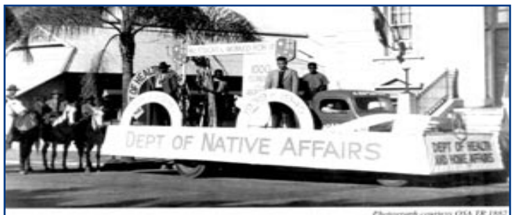
Above: Labour Day Rally in 1946