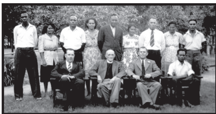
Palm Island's Social Welfare Committees – above in the 1950s and below in the 1960s

"This idea of taking a page out of their book and doing things the way they used to do them – without money – would mean so much more to everyone involved," he said.