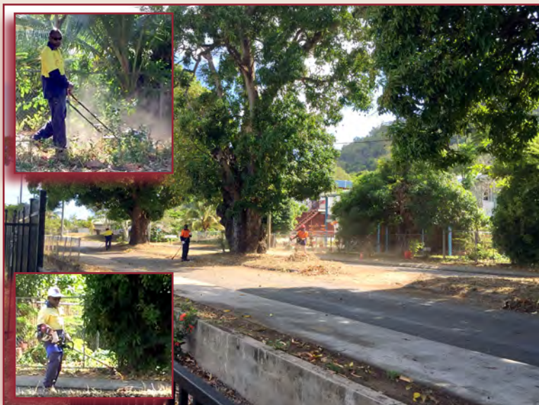
ABOVE: Ralph Doomadgee & Ian Ketchup working on Mango Ave walkways and centre island;

"Our staff have been proud to market and promote their services," she said. "Lots will be happening in the training and enterprise space up until Christmas including opportunities in construction training, plant operator tickets, online learning, arts and crafts, life skills, and men's and women's groups, all working under Covid-safe conditions."