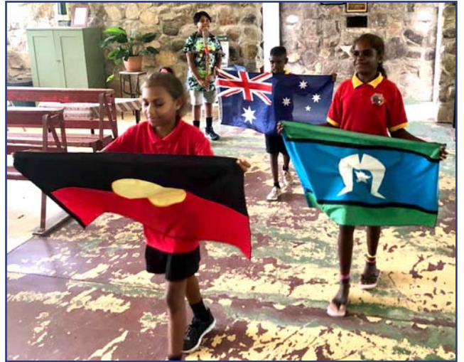
ABOVE: Year 6 led us in prayer. We prayed that we would care for our Earth and all the people of the world as Pope Francis asked us to in his letter, Laudato Si .