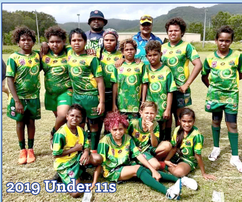
2019 Under 11s