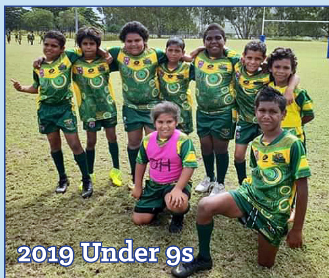
2019 Under 9s

She said more volunteers were needed for the next round of home games on Saturday 1 June.