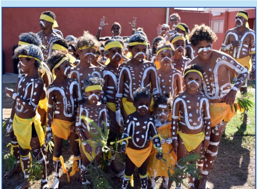
ABOVE: Palm Island dancers ready to 'wow' the crowds at the Palm Island Deadly Futures Healthy Sports Carnival – full story and more pics on pages 6–8