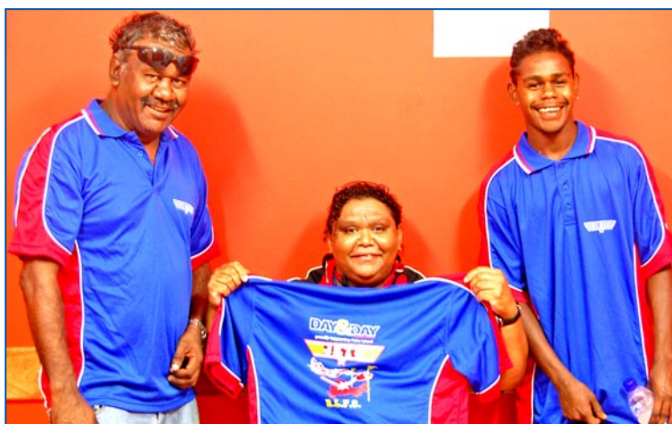
Local team members & supporters sporting shirts sponsored by Day & Day

"And we're sponsoring an NRL footy competition notice board.