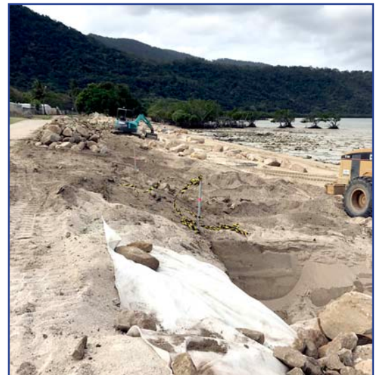
Butler Bay revetment Wall, $1.24m retaining wall to protect the community and community infrastructure in partnership with the Department of Infrastructure, Local Government and Planning