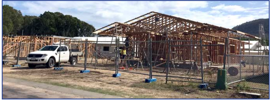
Community Housing, $16m, Construction of 7 new community houses, funded by the Department of Housing