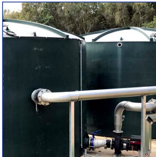
Water and sewerage upgrades $1.8m upgrade to the water and sewerage treatment plants in partnership with Department of Infrastructure, Local Government and Planning