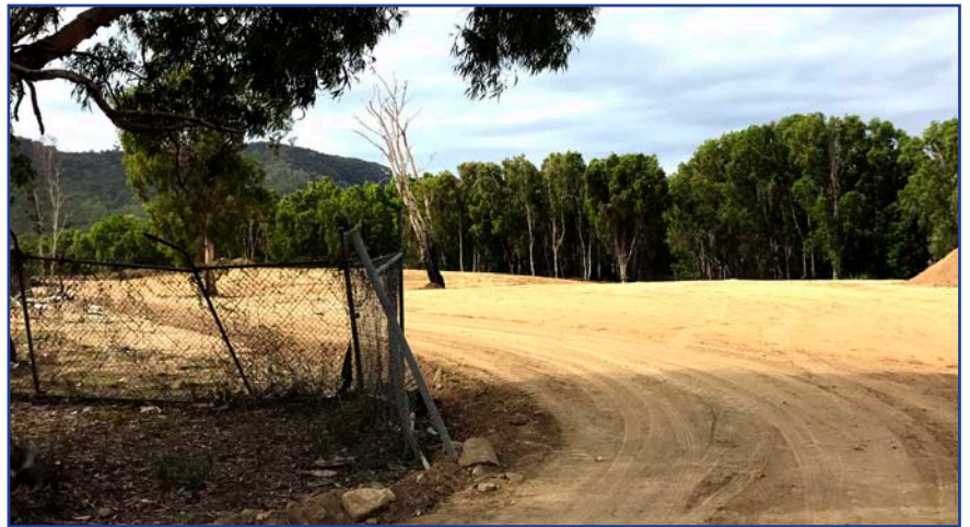
Tip Rehabilitation, $1.35m, Rehabilitation of waste disposal facility including capping of the tip and removal of car bodies in partnership with Department of Infrastructure, Local Government and Planning