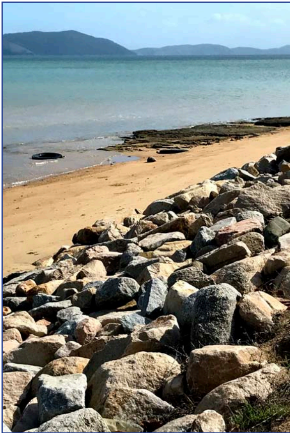
Clump Point Rd revetment wall, $2.21m recently completed retaining wall to protect the community and community infrastructure in partnership with the Department of Infrastructure, Local Government and Planning