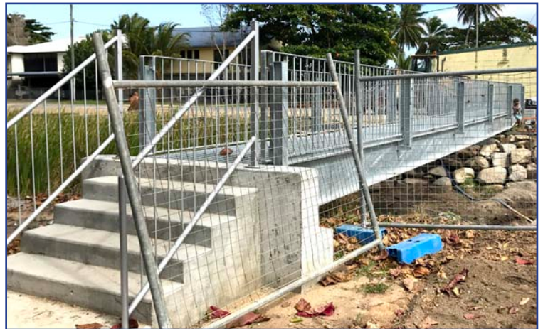
Sandy Boyd Bridge upgrade, $0.12m, Widening and resurfacing of the Sandy Boyd Bridge in partnership with the Department of Transport and Main Roads