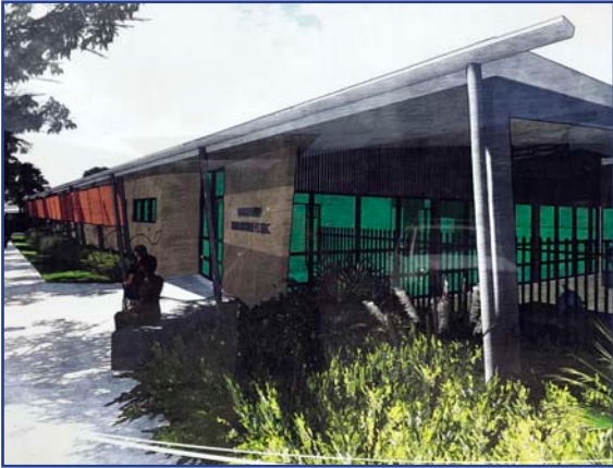
Primary Health Care Centre, $16.5m, Funded by Townsville Hospital and Health Service, Queensland Health and Significant Regional Infrastructure Projects