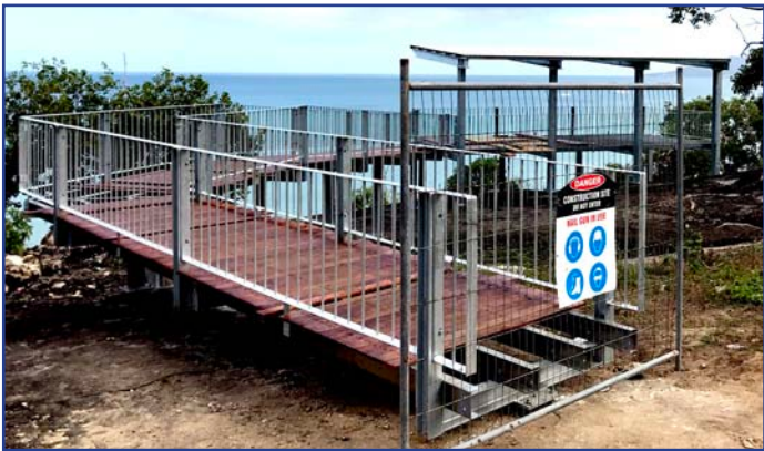
Casement lookout, $0.12m, Construction of a scenic lookout for the community and visitors in partnership with the Department of Transport and Main Roads

“We’re in this together and these changes are for all of us – for a better life for all of us – and everyone can and will benefit at the end of the day.”