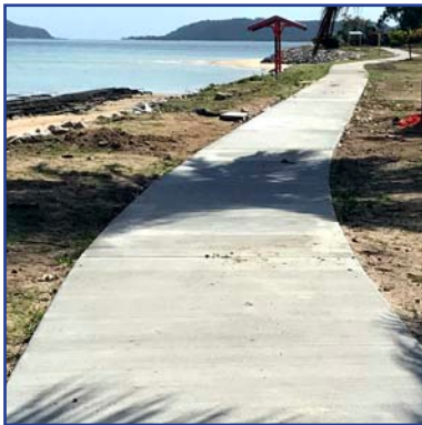
Community Connectivity $1.6m, Construction of a footpath from the bistro to Manbarra Road along the foreshore to improve community connectivity Increase healthy activity. In partnership with Department of Infrastructure, Local Government and Planning