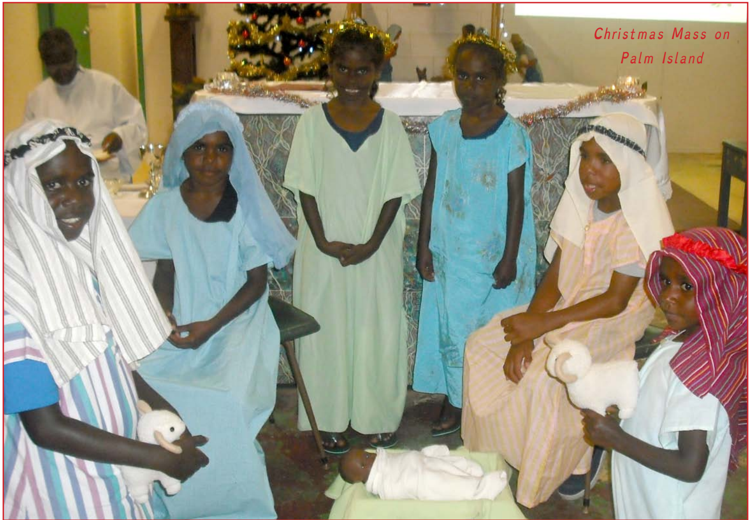
Christmas Mass on Palm Island