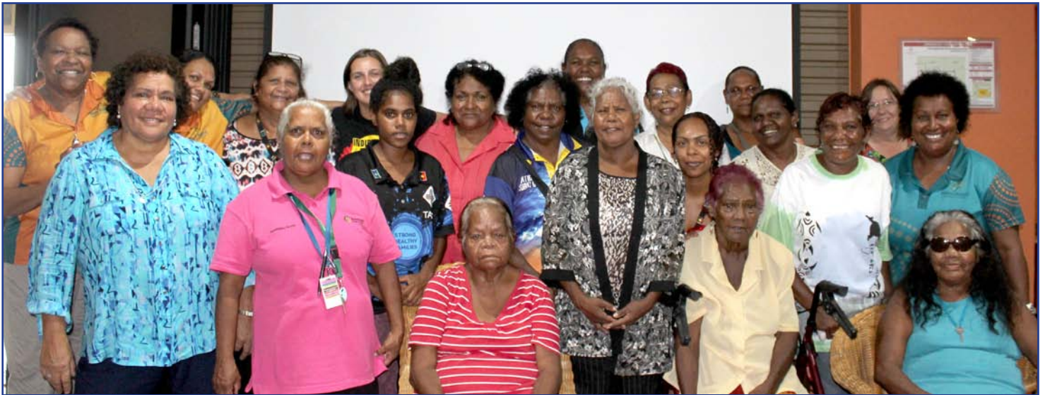
The first women's conference held by the Palm Island Aboriginal Shire Council had a huge turnout with some great outcomes, participants said. Women from different organisations such as PICC, Solas, Hospital, Rehab and Justice Group were all in attendance. High on the agenda was health, and particularly diabetes.