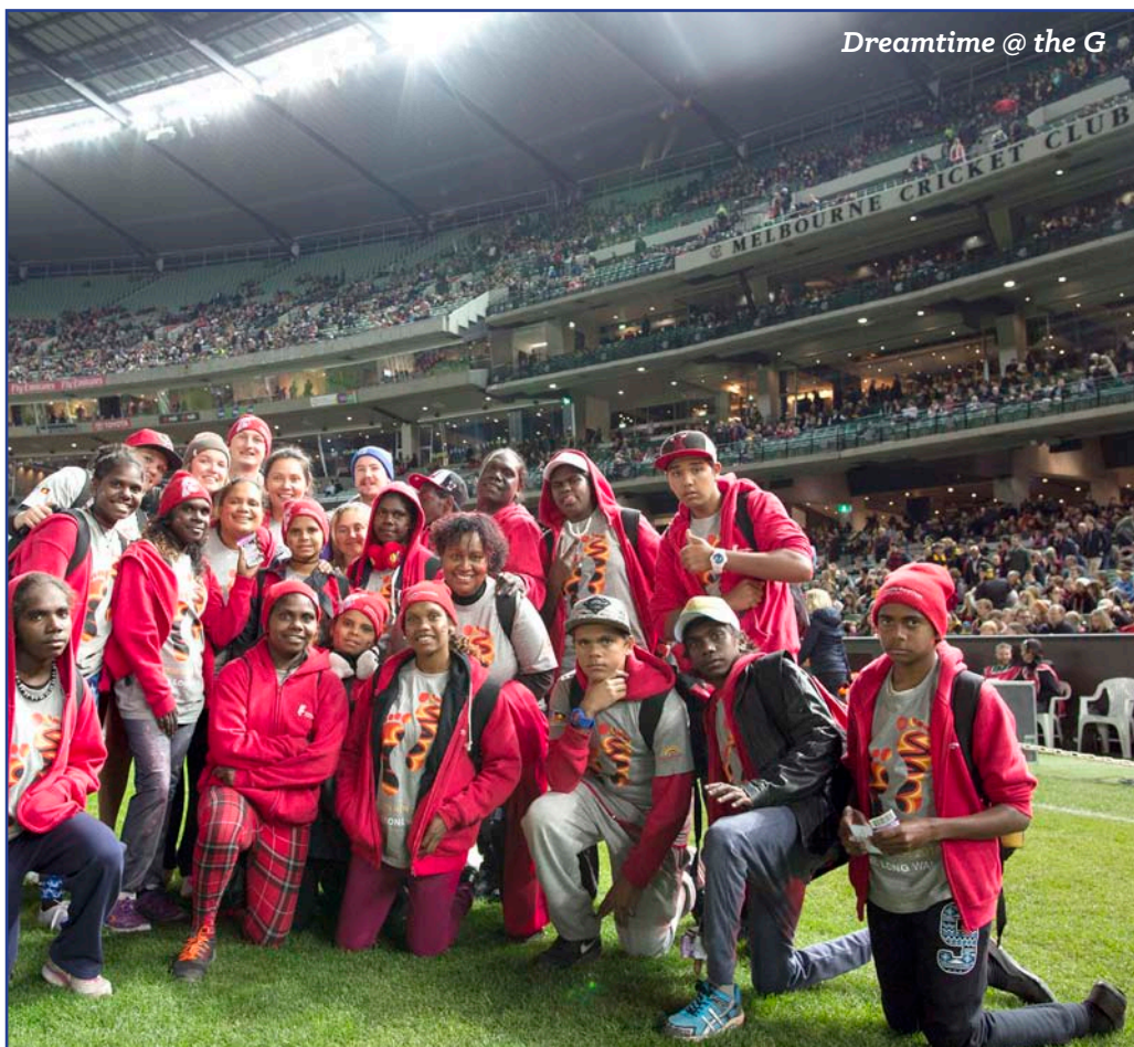
Dreamtime @ the G

"It has been really moving to see the pride in the children receiving Starting