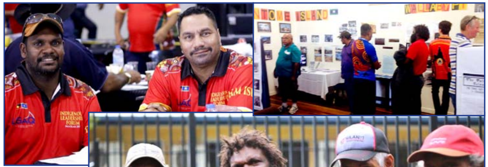
These pics are thanks to the LGAQ

To make an appointment call (07) 4752 5100.