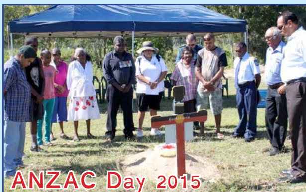
ANZAC Day 2015

Around 1pm many gathered at the Coolgaree Sports Bar and Grill where they enjoyed a few drinks, lots of friendship and even some Two Up.