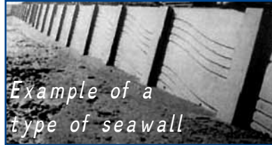
Example of a type of seawall

“The cost will be close to $12 million dollars to protect the beautiful foreshore, particularly around the town area of Palm,” he said. “The successful designer has been contracted by the Council to further develop those preliminary designs, so what you see here is just a small part of what’s to come. So Council is still working on this worthwhile project which is progressing well. And as well as these crucial works, Council is also pushing for the beautification of the foreshore in the town area so we can turn our ‘main entrance’ into a well-developed family recreational area so families and visitors will be able to enjoy our waterfront. That’s why it’s important to inform the community